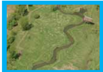
LILY CACHE SLOUGH