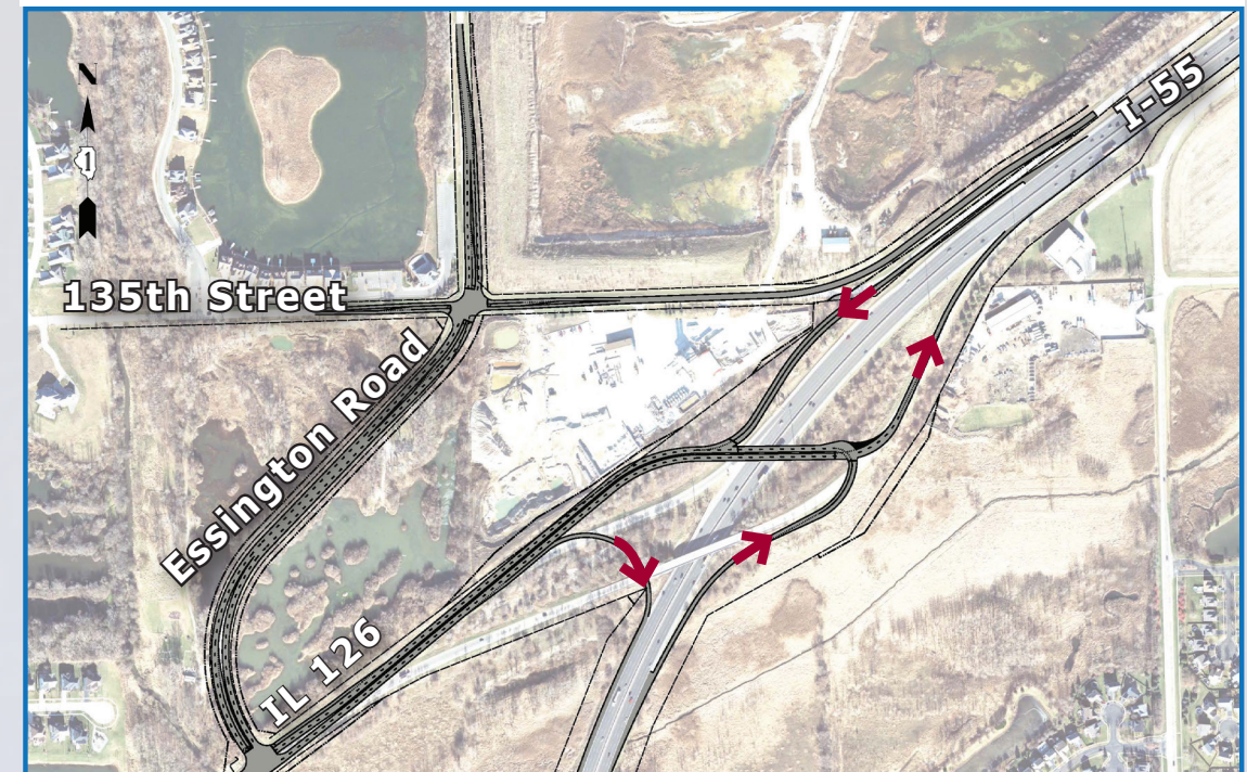
Alternative 28 - Diamond Interchange