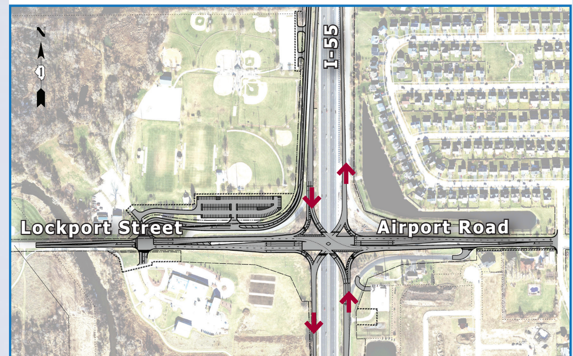
Alternative 5 - Single Point Urban Interchange (SPUI)